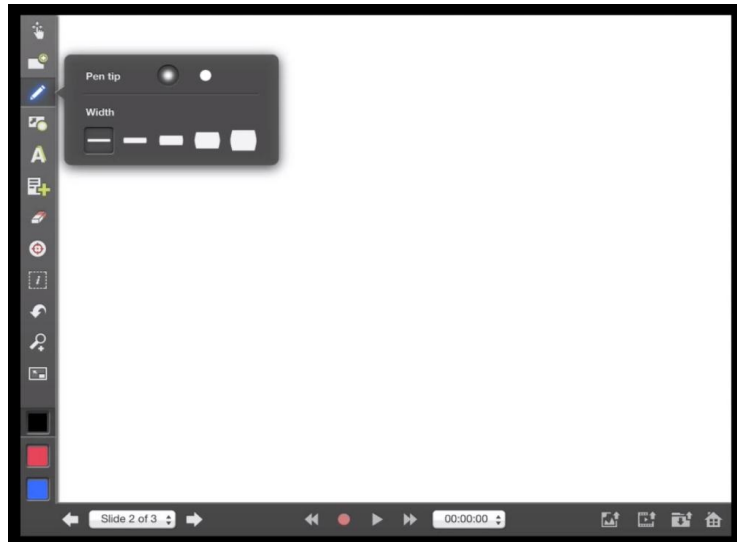
Figure 2 – Pencil/Pen Submenu