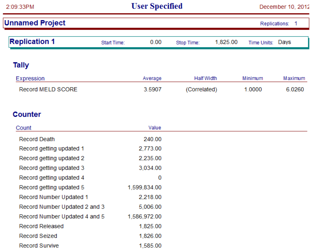
Figure 2: Screenshot of Arena Output

survive after one year, while 240 of these patients did not survive. This gave us an 86.9% survival rate, which was the highest survival rate of our five trials. During our simulation for this range, our reports showed us that the average MELD Score of the patients in our system, throughout the five years, was 3.5709. This means that the average score was in the 15-20 range. The number of MELD Scores updated through the loop in the 6-10 range was 2,218; in the 11-14 and 15-20 range were 5,006; and in the 31-40 range was 1,586,972. The report produced from Arena is shown in Figure 2.