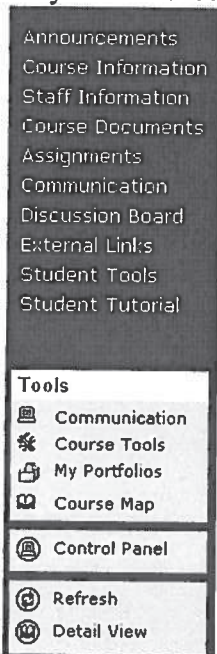
Figure 1: An unmodified Blackboard menu.

With any of these systems or an open web site, the organization of the information as well as the clarity of the main menu makes the system or the site user-friendly. For example, an unmodified Blackboard menu may contain entries for Announcements, Course Information, Staff Information, Course Documents, Assignments, Communication, Discussion Board, External Links, Student Tools, and Student Tutorial as well as a tools box with entries for Communication, Course Tools, My Portfolios, and Course Map and a views control box with entries for Refresh and Detail View; of course, there is a Control Panel entry on the instructor's menu as well. A large number of general entries can make a menu difficult to use and, thus, make information on a site tricky to find/access. Figure 1 and Figure 2 provide examples of unmodified and